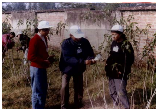
Students performing transpiration experiment