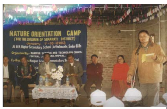
Inaugural function of the Senapati District Nature Camp.

The Senapati camp was organized . by MASTEC in co-ordination with Manipur Science Communicators' Association, Imphal and H.M.higher Secondary School, Keithelmanbi. during January 7 – 10, 2003 at the campus of H.M.Higher Secondary School, Keithelmanbi, Senapati district.