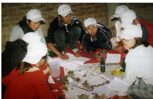
Sorting and Analysis of collected samples by the students.