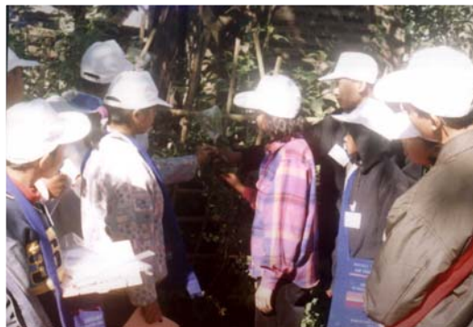
Students performing transpiration experiment