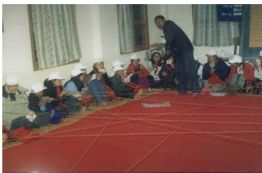
Students playing nature web game

Altogether 50 campers comprising of students and teachers team from various schools of Chandel district participated in the training camp. Three key resource persons namely 1) Shri Kh .Manigopal Singh, 2) Shri S.Damuder Singh and 3) Shri I.Sushilkanta Singh taught the participants about the nature through a series of hands on activities. Apart from the 3 key resource persons, 3 lectures on various topics related to nature were also delivered by Dr.S.Pravabati Devi, Reader, Imphal College, Imphal, Dr.B.Manihar