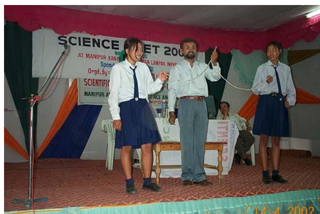
Explaining science behind miracles

Miracles or magic are old human activities which make people wonder or confuse and in many cases mislead the general public. Many items of science behind miracles were demonstrated by the expert members of MASS during Science Meet 2002 and the scientific background of the shows were also explained. Some of