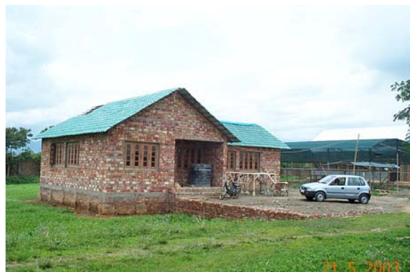
Solar Passive Building phase- I