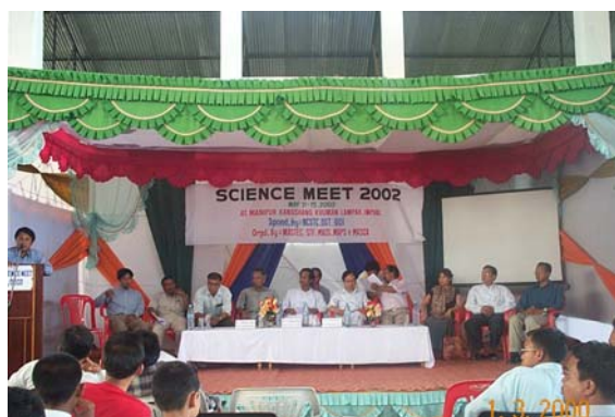
Closing Function of SM 2002