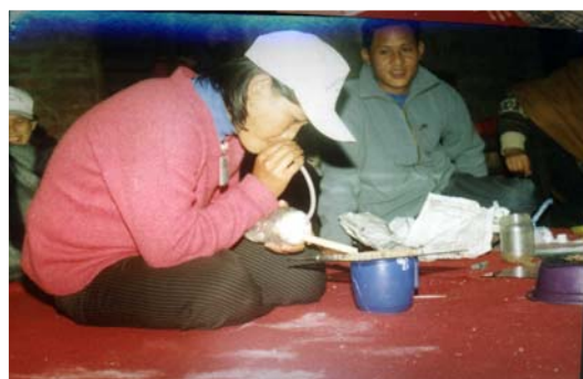
A girl using a low cost device for catching insects.

During the 4 days programme, the topics such as Identification & classification of Animals, Identification & classification of Plants, Bio-diversity an overview to ecology, Sky watching with demonstration, Sorting, Analyzing and preserving samples, Science games, Songs, Light physical exercises, Green House effect, kitchen gardening, Fun with Plants-studying the parts/Processes & exploring the whole, Looking at small animals, Living together- study of habitat/ecosystem, Role plays, Field trips, The micro world, Slide shows on pollution, deforestation, evolution of man & animal welfare, Video shows on wild life, The physical natures – soil, water & air, The camp was concluded on the last day with a small closing function.