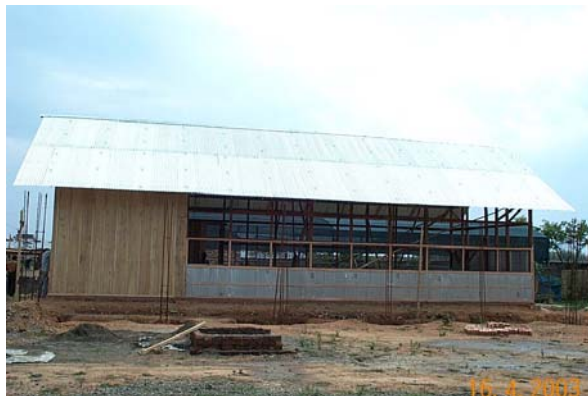
Quail rearing shed