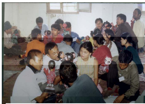
Participants practicing puppet manipulation