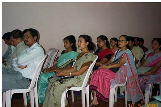
A section of the participants group