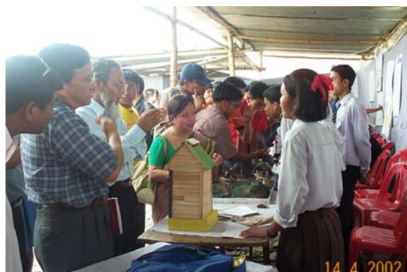
Model exhibitors interacting with visitors

The competition was open to the students reading in class VIII – XII. Altogether 47 (forty seven) models were exhibited by 88 ( eighty eight) students ( 55 boys and 33 girls) in the competition. The models were based on varied themes – Electronic gadgets – 8 models, Issues on Environment – 3 models, Technological application – 28 models and other themes of interest – 8 models.