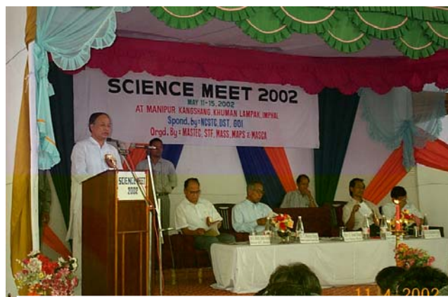
Chief Minister delivering inaugural speech