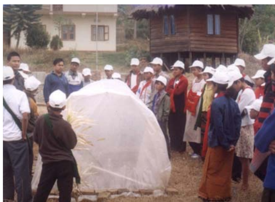
Demonstration of Green House to the students.