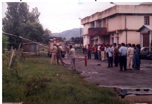
Fire Service Personels Demonstrating Use of Fire Fighting Equipment