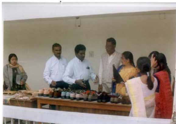
Exhibition of local made footwears

Altogether forty (40) participants (artisans, entrepreneurs, designers, shoe makers etc.) from various parts of the state attended the programme. A team of 10 (ten) scientists from CLRI including Dr. P.G.Rao, Director, RRL, Jorhat and experts from the financial institutions like SIDVI and NEDFI delivered series of lectures and also interacted with the participants during the programme. About 60 items of leather goods (leather combined with textile /silk/bamboo based products) and foot wear designed and fabricated by CLRI and local artisans/ designers were exhibited during the two day programme.