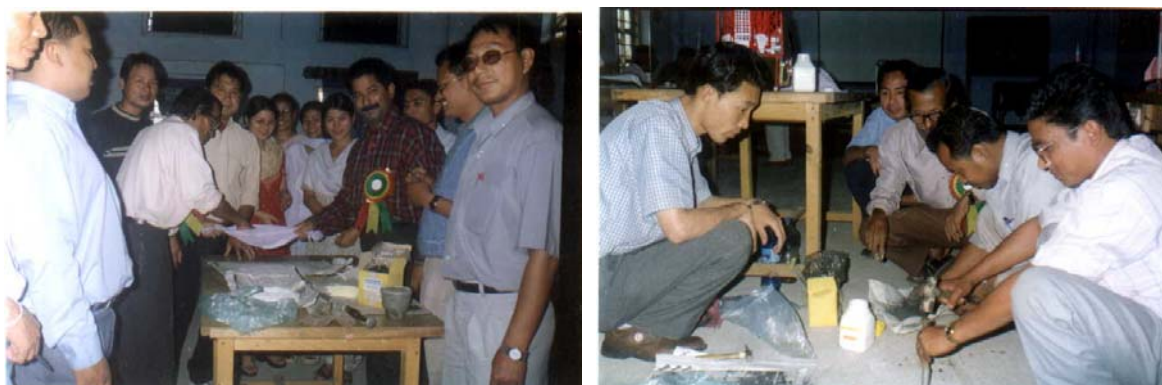
Construction of rocket engine

Altogether 15 teams consisting of two science teachers from 15 schools / colleges including University and Science NGOs participated in the training. Delivering lectures,