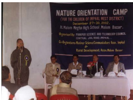
Inaugural function of the Imphal West Nature Camp

The Imphal West Nature Camp was held from December 27 to December 30, 2002 at the campus of Malom Megha High School, Malom Bazar, Imphal West District.