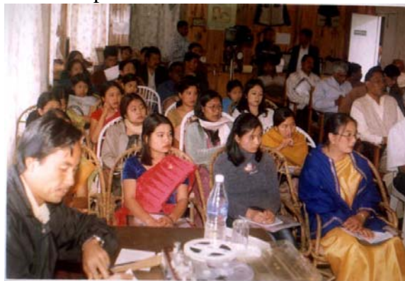
A section of the participants