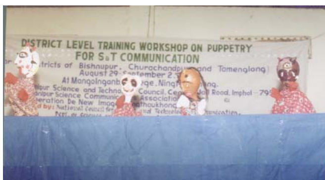
A Puppet show presented by the participants of the Ningthoukhong workshop

Altogether 33 participants from the above three districts attended the 5 days course. Three local resource persons on puppetry namely Shri S.Beeran Singh, Shri I.Sushilkanta Singh and Shri Y.Ojit Singh acted as resource persons for the overall programme. Under the same module of NCSTC, DST, GOI, the 3 key resource persons imparted training to the participants about the art of puppetry for S&T communication. The course included