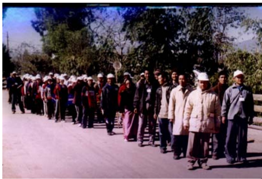
Nature Walk (Churachandpur Camp)