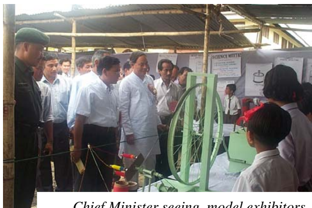
Chief Minister seeing model exhibitors

Due to their failure to get appropriate assistances and supporters from the government or the society, their precious ideas and inventions simply die out. This is a big loss to the society. In order to ferret out these silent innovators and encourage them to venture further into more and more innovations, some effort like exhibitions and workshops are required. Hence, in tune with the national theme Developing the spirit of Innovation of the National