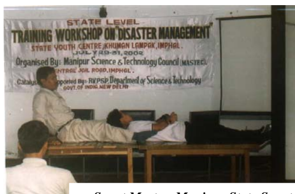
Scout Master, Manipur State Scout Demonstrating Rescue Operation