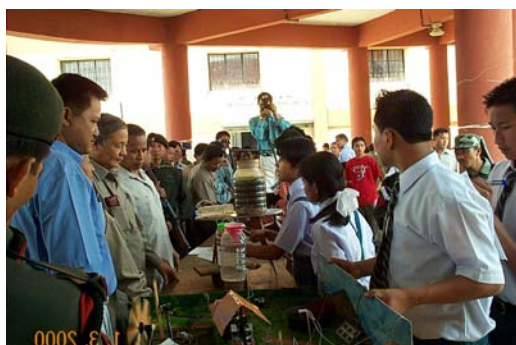
Chief Minister interacting with science model exhibitors

In his presidential remarks, Shri T. Manga Vaiphei lauded the role of MASTEC in the science popularization activities in the state.