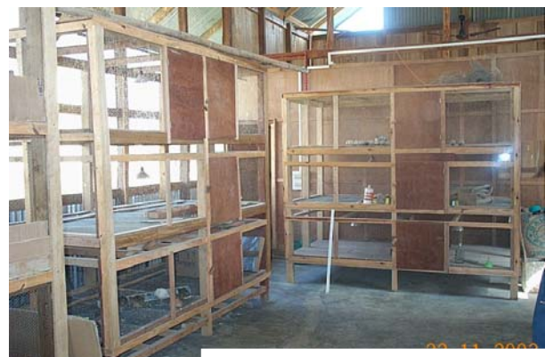
Multi layer quail rearing cages

The three layer quail rearing cages have been constructed by engagement of local artisans. All the cages are of wooden structure with wire mesh wall.