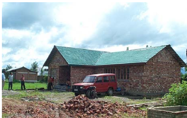
MASTEC Passive Solar Building: Side View

The objective for the construction of the MASTEC office building was to demonstrate the following concepts of energy efficient building in the North eastern Region.