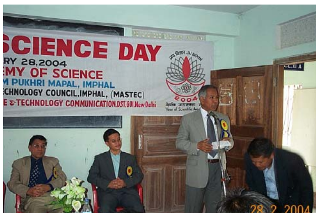
Minister (Hr. & Tech. Edn.) giving inaugural address