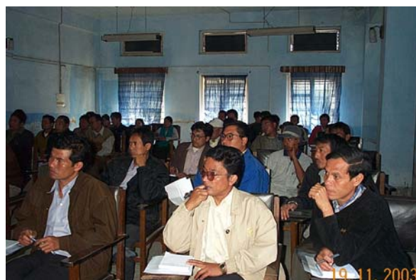
A section of the participants