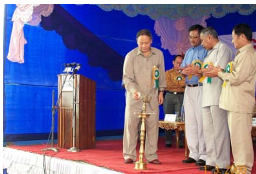
Chief Minister inaugurating SM 2003

Since the year 1997, Manipur Science & Technology Council (MASTEC) in coordination with the leading science NGOs of the state has been continuously organising the state level festival named as Science Meet. Science Meet is a multi- activity state level science festival aiming at creating a common platform for science students, science lovers and scientists to further the cause of Science Popularisation. MASTEC in coordination with the leading science NGOs of the state like Manipur Association for Science and Society (MASS), Manipur Association for Promotion of Science (MAPS), Manipur Science Communicators' Association (MASCA) and Generation De New Image (GENIM), has organised the 5 day long Science Meet 2003 during May 11-15, 2003 at Khuman Lampak Main Stadium, Imphal. Science Meet 2003 was organised in commemoration of the National Science Day and National Technology Day 2003.