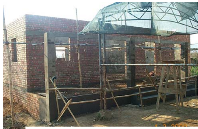
Construction of Work shed in progress

Purse seine Fishing : - Purse seine fishing is under trial.