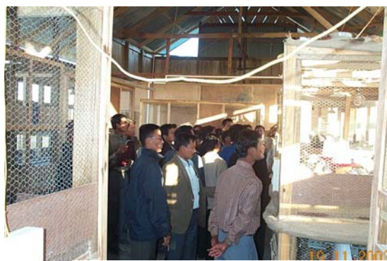
Participants visiting quail centre

All the participants along with some journalists/reporters who attended for coverage of the programme were taken to the recently constructed Quail Demonstration Centre of MASTEC at Takyelpat where adult quails were kept. The participants also visited the Hatchery of the State Veterinary Department. on the second day of the training