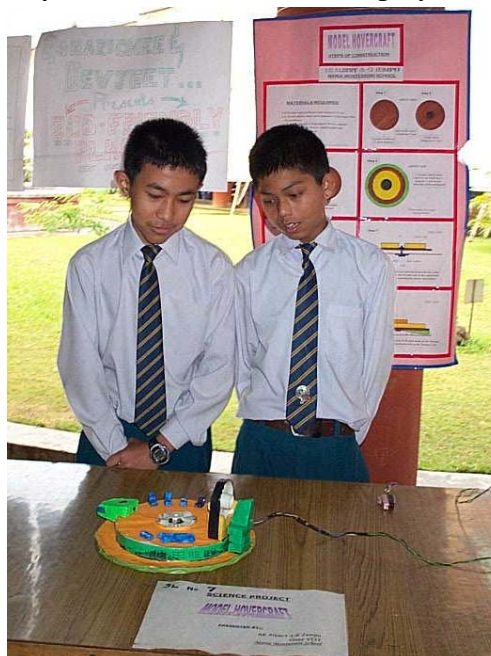
First Winner of Model competition

Science Model Competition : The competition was open to the students reading in class VIII – XII. Altogether forty two(42) models were exhibited by 76 ( seventy six) students ( 50 boys and 26 girls) from 16 different institutes/ schools. The models were based on varied themes such as electronic gadgets – 12 models, Issues on environment – 8 models, technological application – 16 models and other themes of interest – 6 models.