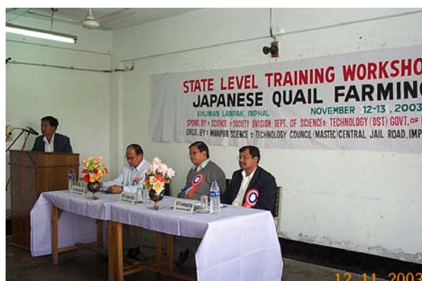
Inaugural function of the training : From right ,1. Executive Director, MASTEC, 2. Director, Veterinary Dept, & 3. Director, DST Govt. of Manipur.