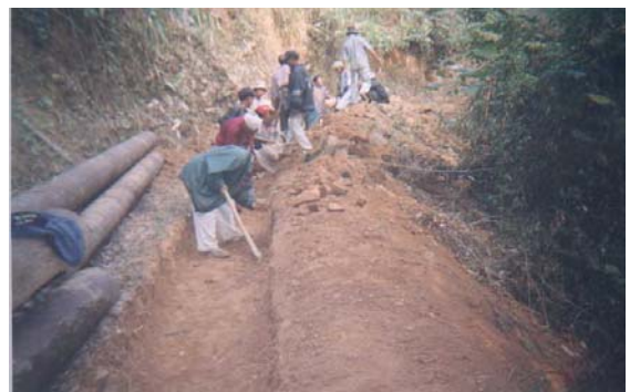
Trench for Penstock laying

Two AC Generators, two Control Panels and two Electronic Load Controllers and two turbines have been received and are yet to be installed.