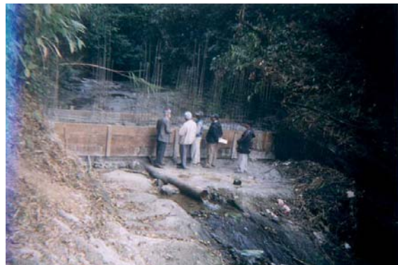
Construction of Diversion Weir