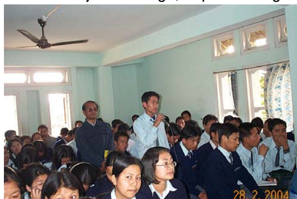
Students interaction with the resource speakers