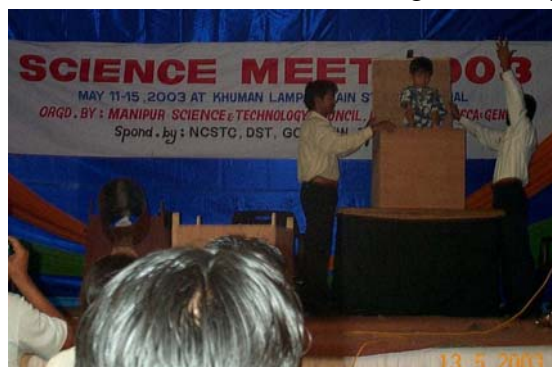
Science Behind Miracle Show

Science Behind Miracles : Miracles or magics are old human activities which make people wonder or confuse and in many cases mislead the general public. Many items of science behind miracles were demonstrated by the expert members of GENIM and also explained the scientific background behind it. The items such as Child killing box, Holy ash, Rope tricks, Mysterious handkerchief, Fire with mental power, Vanishing and returning coin, Water from heaven, Change of roshgula to handkerchief, Trisul piercing in tongue, Needle piercing in skin, Reading by ear, Counting match sticks, Water to blood, Rose presentation, Water to tea, Miracle bag, Calling of soul, Changing of handkerchief colours, Child killing box, Child shooter canon (top) etc. During the 5 (five) days Meet 2003 the programme of Science behind miracles was kept for 4 (four)