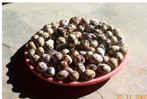
10 gm. weigh quail egg

The hatching eggs are made available to the interested farmers/ individuals @ Rs 0.75 per egg and commercial eggs @ Rs 0.50 per egg. The weight of the eggs ranges from 10 gm to 12 gm. The response from the