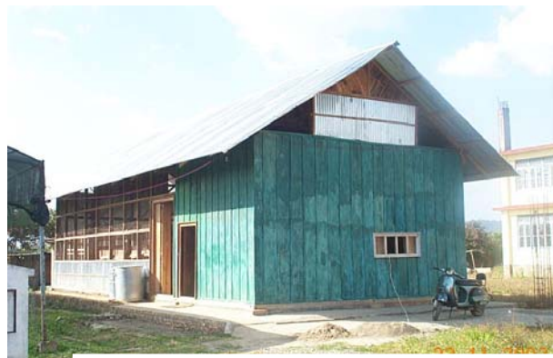
Japanese Quail demonstration centre

The demonstration center / rearing shed of the Japanese quail has been constructed at the plot of Manipur Science & Technology Council at Takyelpat, at a distance of about 4 km. in the west from the Capital town Imphal. The shed is a wooden structure with CGI sheet roofing and cement concrete floor. The shed consists of two rooms viz, project office / staff room and quail rearing room where there is space for installation of cages for a capacity of about 10000 ( ten thousand ) quail birds