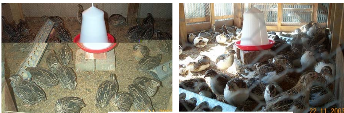
Adult Japanese Quails in the demo. centre

Incubation and Hatching : The Principal Investigator and the Project Assistant paid a visit to the Experimental Quail farm of the Central Avian Research Institute (CARI), Barielly, U.P. to see their rearing facility, learn the techniques of the rearing and also expert consultation. One thousand number of fertile hatching eggs of quail were procured from CARI for incubation at Imphal. The eggs were incubated and hatched at the hatchery of State Veterinary Department. Out of 1000 eggs incubated, we could get 700 number of quail chicks i.e. @ 70%. The chicks were reared at the Quail demonstration centre of the Council as parent stock. A mortality rate of about 8% was faced while rearing the quails.