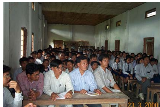
Audience attending lecture programme