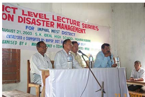
Resource persons at the Dias

The main objective of the lecture series was to make people aware of the disasters commonly occurring in the North-Eastern region. The lecture series was conducted