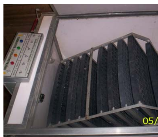
Hatchery unit established at MASTEC Complex, Takyelpat, Imphal