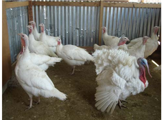
10 female & 1 male turkey in the breeding room

The turkeys procured from CARI, Barielly became natured and female turkeys started laying eggs in the month of March 2007. Earlier the male and female turkeys were kept separately from each other. As they have been quite mature, they have been kept in the ratio of 1:10 i.e. 1 male is to 10 female as advised by the experts of Turkey Research Unit, CARI, Bareilly. Collection of fertile eggs were done for incubation and hatching. The existing 40 female (adult) were doing well. Rest were male. The males were in excess. After keeping the desired number of males in appropriate ration, with some extras, the rest male turkeys had been sold out @ Rs 150/- per kg ( live) to the interested public.