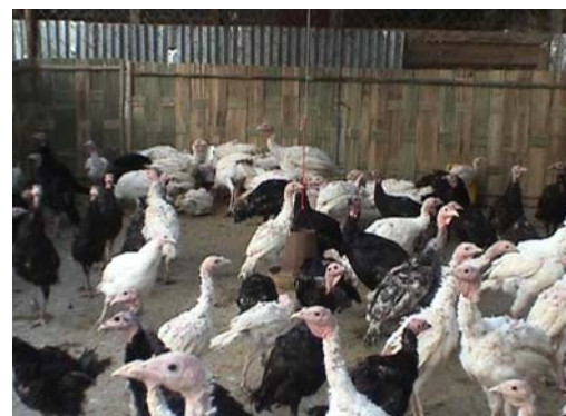
Some of the existing turkeys at the farm