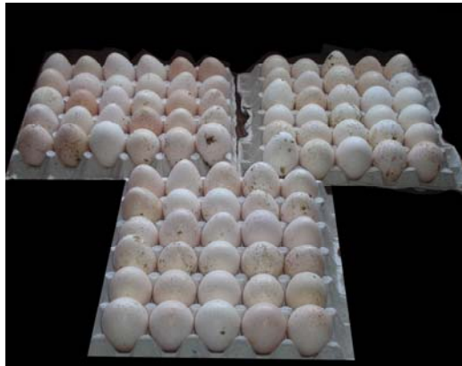
Fertile eggs of turkey

The first batch 70 eggs collected from the turkey farm has been put in the hatchery on 17 th March 2007 and its date of hatching falls on 13 th April, 2007.